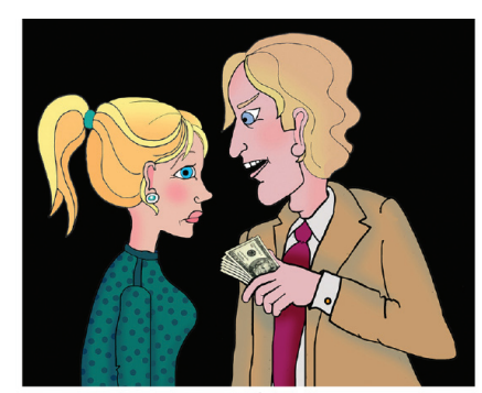
EconoMan Splains Money

Economics, Macroeconomics, Microeconomics, Commodities, Inflation, Income, Investment, Interest, The Informal Economy, Economy & Ecology Supply & Demand, Aggregate Supply & Aggregate Demand, Property & Assets, Consumer Markets, Stock & Commodities Markets Capital, Mortgage, Compound Interest, Credit, Debit, Securities, The Washington Consensus, Bear & Bull Markets, US Treasury Securities, Credit Cards, Futures, Derivatives, Bankruptcy, Millions, Billions, Trillions, Mortgage Securities, TARP, Due Diligence, Moral Hazard, Ratios; Quintiles; The World Bank, the IMF and WTO, Redlining, Opportunity Cost, For-Profit, Non-Profit, Un-Profit, Production, Capital Accumulation, Consumption, Pareto Efficiency, Wall Street, Main Street, Double-Entry Accounting, Audit, Gross Domestic Product (GDP), UN System of National Accounts, Bottom Line, Gross National Happiness, Genuine Progress Indicator (GPI), Time Accounts, Corporation, Stock & Shares, Property & Real Estate, Salary, Wages, Work Day, Work Week, Externality, Exponential Growth, Hedge Funds, Women's Banking, Credit Unions, Taxes, National Spending/National Debt, Women's Status, Ethical Investing, EroNomics, US Income Tax, US Capital Gains Tax, Demurrage